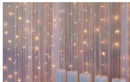
Backdrop Lighting Just lighting: $20 per 9 ft. sect. With Fabric $60 per 9ft. sect. With Drapes $75.00