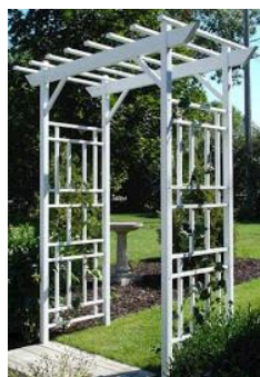
White Arbor: $60.00 Dimensions: 72"Wx42" Deep x 95" H Walk Through 50"