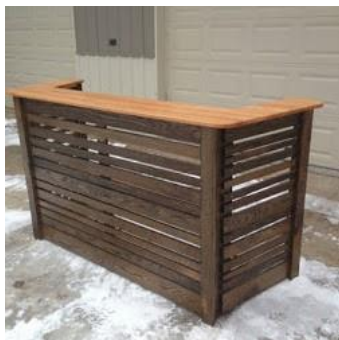
Bar: $100 Comes with shelf and Lights