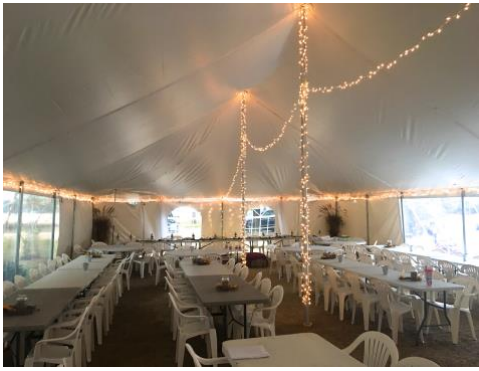
Lights on Poles: $25 per pole