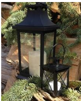
Lanterns: 12 in: $8.00 5 in: $4.00 comes with batteries 12 White large Lanterns Now Available