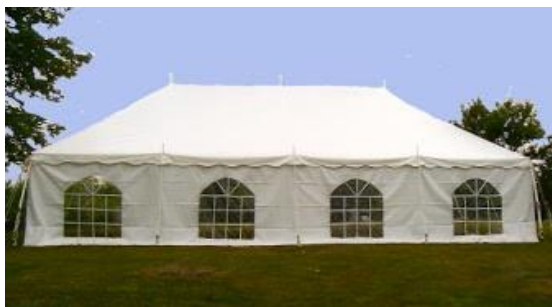
Cathedral Sidewalls: $25 per 20 ft. section Installed $30 per section