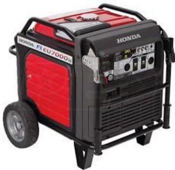
NEW: Honda Super Quiet Generator $80 for first 2 hours then $18 for each additional hour 5500 watt, Gas powered with clean inverted power