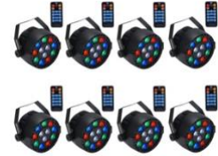
NEW! UPLIGHTING Plug in $ 15.00 each Battery operated: $20.00 each *More Styles on our website!