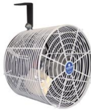
Tent Fan: $25.00 Each 12" Fan, 1.3 amps