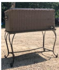
Ice Chest $30