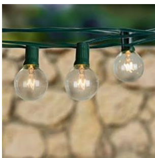
Globe Lighting: $27 per 25 ft. section