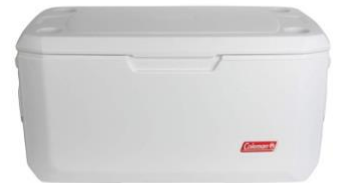
120 qt. cooler: $30 48 qt. cooler: $15