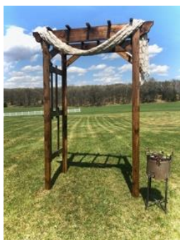
Wooden Arbor: $60.00 Dimensions: 72"Wx42" Deep x 95" H Walk through 50"