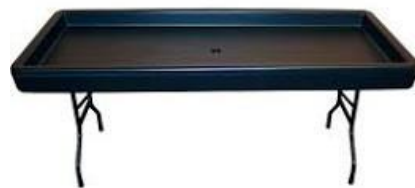
Chill Table: $30 each Keep your food and drinks cold by adding ice