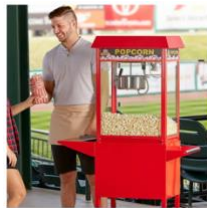
Popcorn popper $50.00 w/refundable $50 security deposit