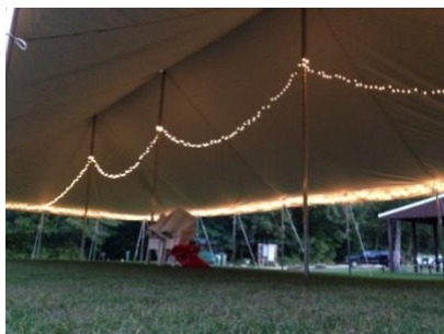
Standard Lighting: 20 series tents $0.35 per ft. 30& 40 series tents $0.50 per ft.