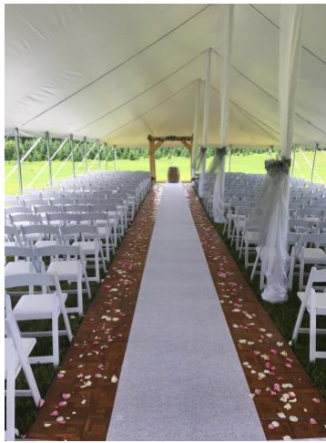
Pole Fabric: $30 per pole