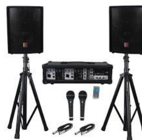
PA System: $75 setup to use Comes with 2 speakers, 2 microphones (100ft or 50ft cord or wireless options)