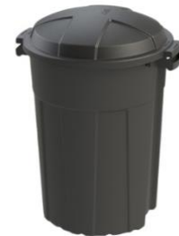
Garbage Cans $ 5.00 each comes with 2 garbage bags per can