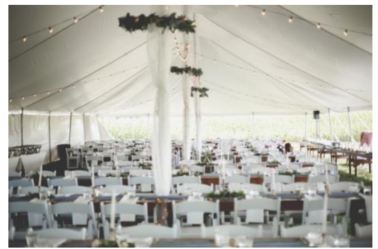
Fabric and Lighting $45 per pole