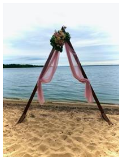
Triangle Arbor: $60.00 Dimensions: 112'H x 98" W