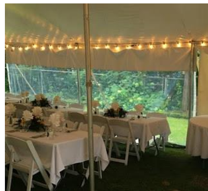
Clear Sidewalls: $25 per 20ft section Installed $30 per section