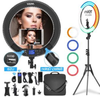
Create your own PHOTOBOOTH $35.00 Ring Light and Stand with Bluetooth Remote.