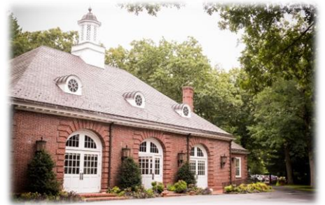
The exterior of The Hunnewell Building

Included in the rental of the Hunnewell Building and attached tent are beautiful, fruitwood Chiavari chairs for up to 250 guests, round tables that seat 8-10 guests each, as well as six and eight-foot rectangular tables. All other rentals such as linens, service-ware and custom furniture are provided by your caterer.