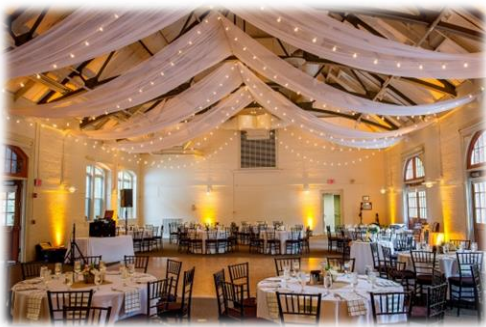
Included Ceiling Decor in the Hunnewell Building