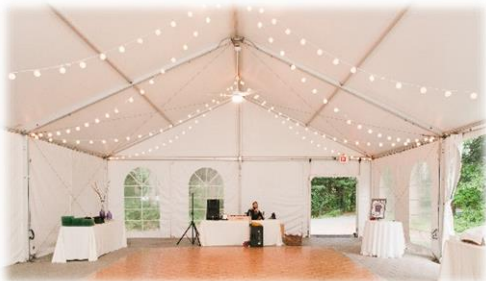
Included Ceiling Decor in the Attached Tent

Lighting is an incredible way to transform this space and for the 2022 season, we will be including a lighting design in your rental. Inside, you will have five runs of elegant, white draping with simple, glowing bistro lights running between each drape. These dimmable bistro lights will allow the space to transform from lively and bright during dinner service to dim and dreamy as guests hit the dance floor! This stunning lighting design will be carried out to the attached tent and courtyard area too. Unique and custom lighting designs are always available too, with special coordination.