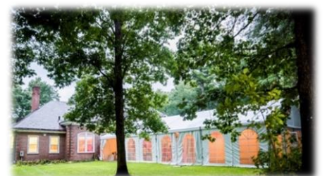
The Attached Tent & Courtyard