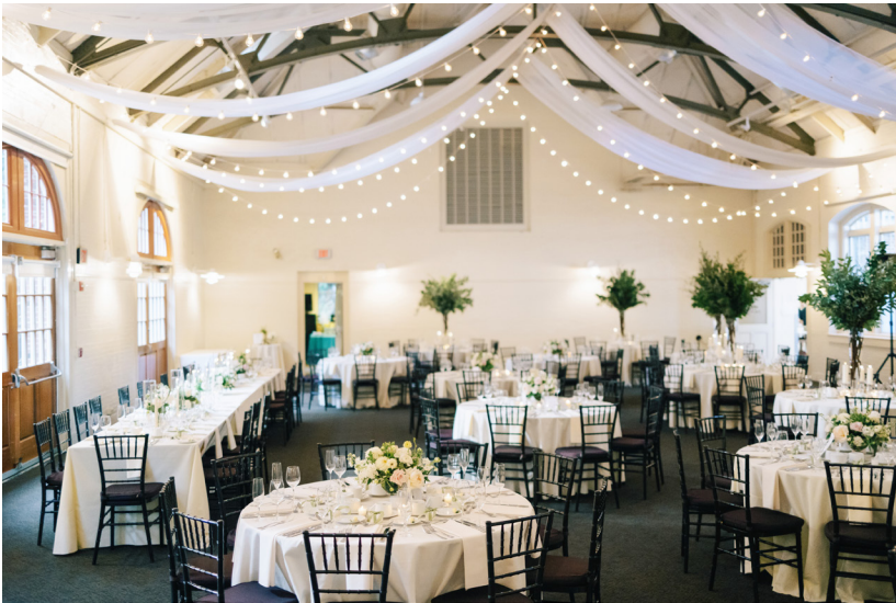
Interior of the Hunnewell Building

The first of our two reception locations is The Hunnewell Building, our historic and stately carriage house. The great hall of the Hunnewell Building boasts nearly 3,000 square feet of open space and is capped with a magnificent vaulted and trussed ceiling. The interior of this building is equipped with heating and air conditioning for optimal comfort at any time of year.