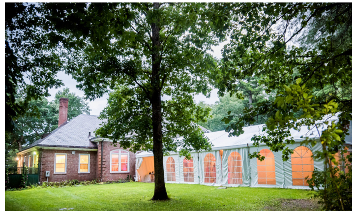
Hunnewell Building Attached Tent and Courtyard