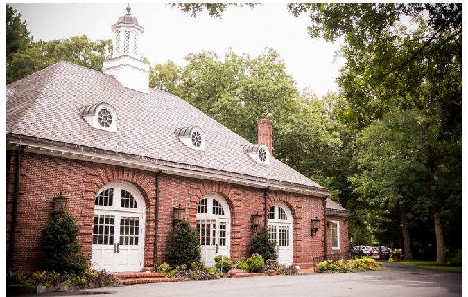
Exterior of the Hunnewell Building

Available for rent through the Garden at Elm Bank is our 20-foot by 20-foot mahogany dance floor which can be placed inside the building, or in the attached tent. Also available as a separate rental are LED uplights, perfect for adding a splash of color to the interior of these spaces!