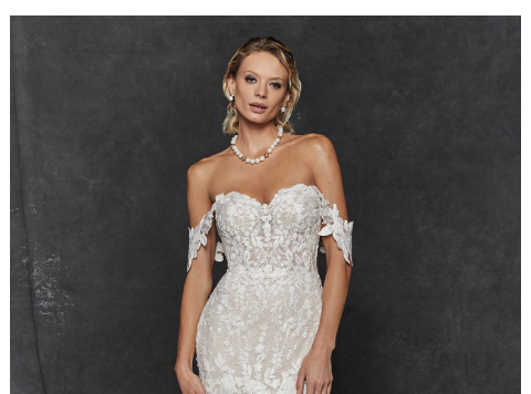
JUSTIN ALEXANDER SIGNATURE $2,100-$4,500

Exclusive to The Bridal Collection for more than a decade, Justin Alexander's classic and timeless wedding dresses have the wow factor you're searching for.