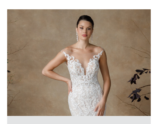
JUSTIN ALEXANDER $1,700-$3,300

Only available at The Bridal Collection in Colorado, The Disney Fairy Tale Weddings Collection will make you feel like a princess.