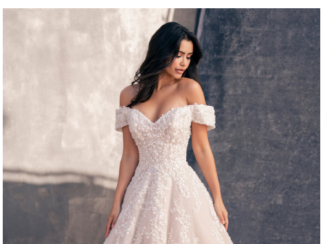
ALLURE COUTURE $2,400-$6,000

All Who Wander strikes a balances between 1970's style and modern designs to deliver casual boho and effortless glam wedding gowns.