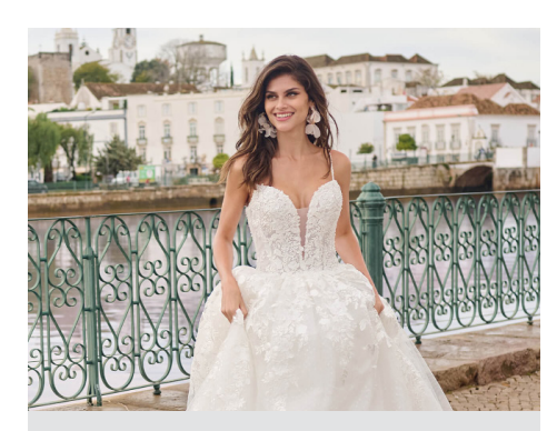
SOTTERO AND MIDGLEY

Specializing in the finer details, Martina Liana blends subtle drama with romantic design elements for the couture wedding dress you've been dreaming of.