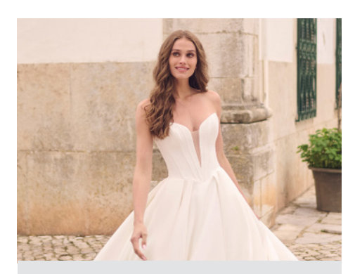
MAGGIE SOTTERO $1,600-$3,000

With unique laces and romantic embellishments, you'll look and feel beautiful as you walk down the aisle in a Madison James gown.