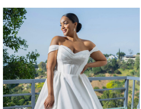
MARTINA LIANA $2,800-$5,000

Designed for modern romance and inspired by today's classic brides, Maggie Sottero wedding dresses offer a variety of affordable styles.