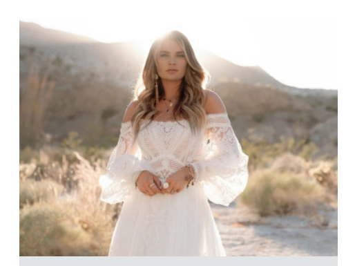
ALL WHO WANDER $1,800-$3,800

All Who Wander strikes a balances between 1970's style and modern designs to deliver casual boho and effortless glam wedding gowns.