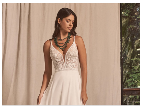
LILLIAN WEST $1,500-$2,800

As Colorado's only shop to carry this couture collection, Lazaro designs are unmatched. Romantic and elegant details create the most dramatic and glamorous wedding gowns.