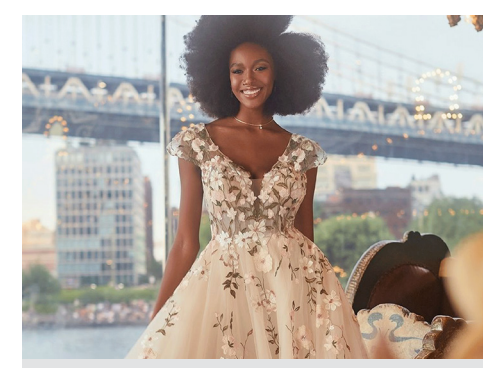
MADISON JAMES $1,800-$3,900

Lillian West's romantic and free-spirited collection marries organic laces with flowing fabrics for the most boho chic bridal gowns.