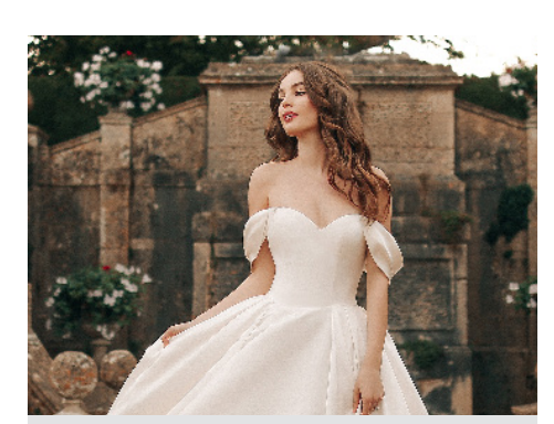
THE DISNEY FAIRY TALE WEDDINGS COLLECTION

Allure Couture is your designer for shimmering, embellished laces in a variety of silhouettes. You'll love all the details that are a part of Allure's gowns.