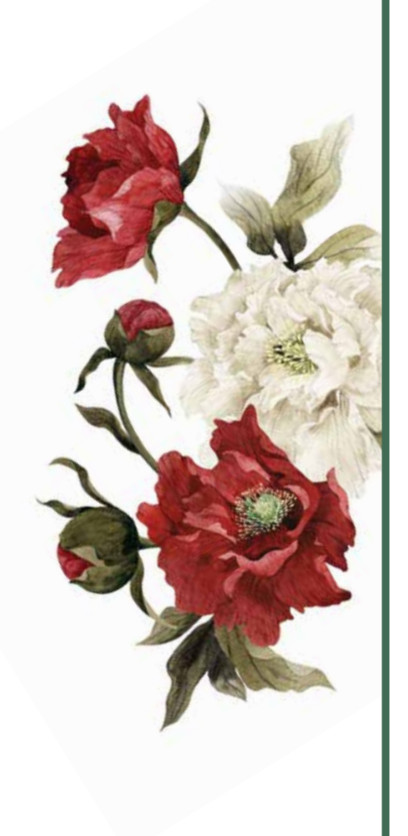
$1,500 per couple

Meals and Rooms Available for your Guests for an Additional Charge