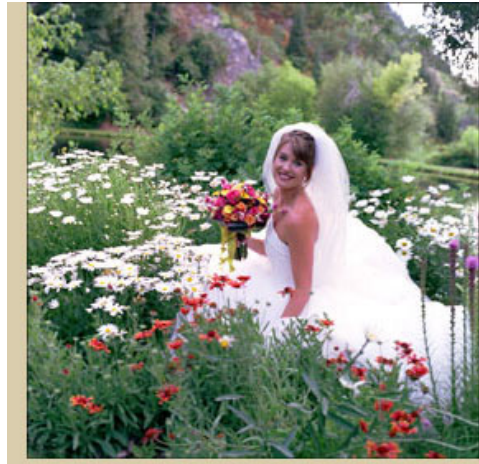
Meadow Bridal Photography | July