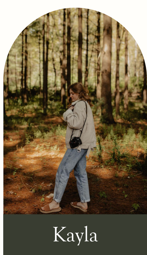
Meet the Team