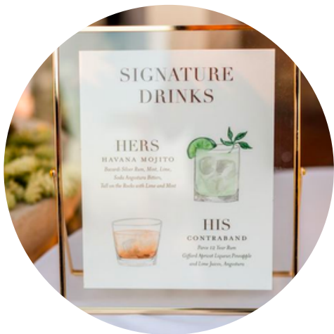
Graphic Design Signs