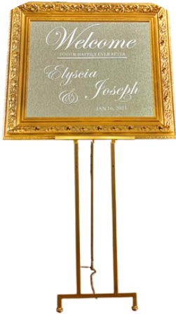
Gold Welcome Mirror and Easel