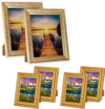
Vintage Gold Frames