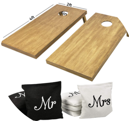
Mr. & Mrs. Cornhole