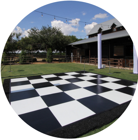
Black & White Dance Floor

$2.20 per sq. ft each tile is 3ft. x 3ft.