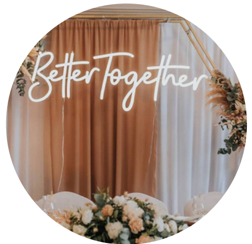
Better Together Neon Sign