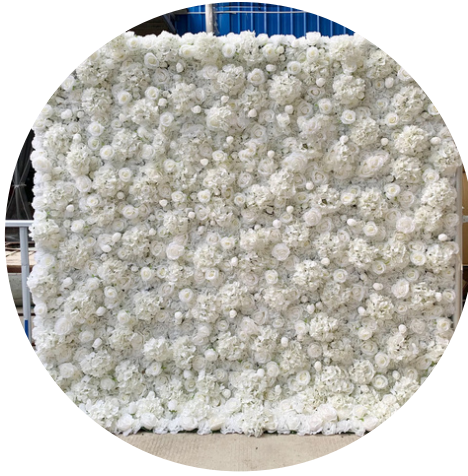
Ivory 3D Floral Wall

$2.20 per sq. ft each tile is 3ft. x 3ft.