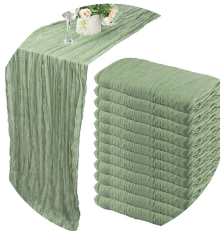
Cloth Table Runner