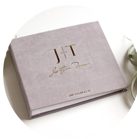
Photo Guest Book