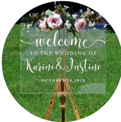
Welcome Sign Vinyl Sticker