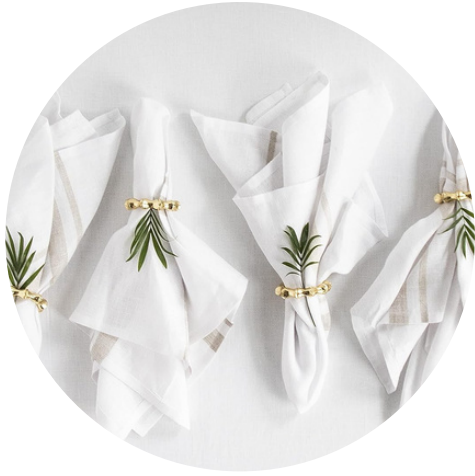
Table Napkin with Clip