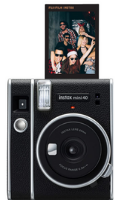
Instant Polaroid Camera