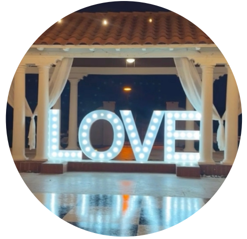
LED Marquee Letters