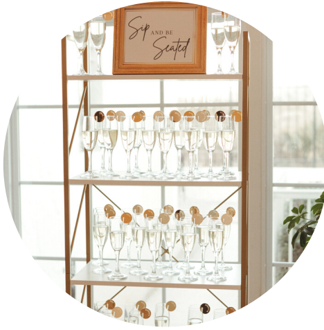
Gold and White Shelf