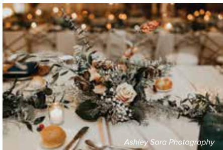
Ashley Sara Photography