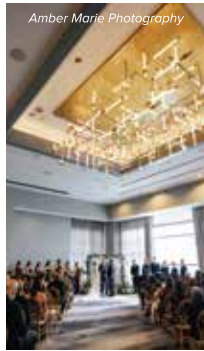
Amber Marie Photography