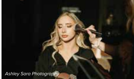
Ashley Sara Photography