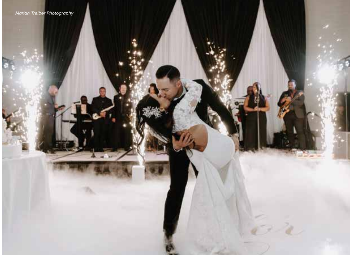
Mariah Treiber Photography