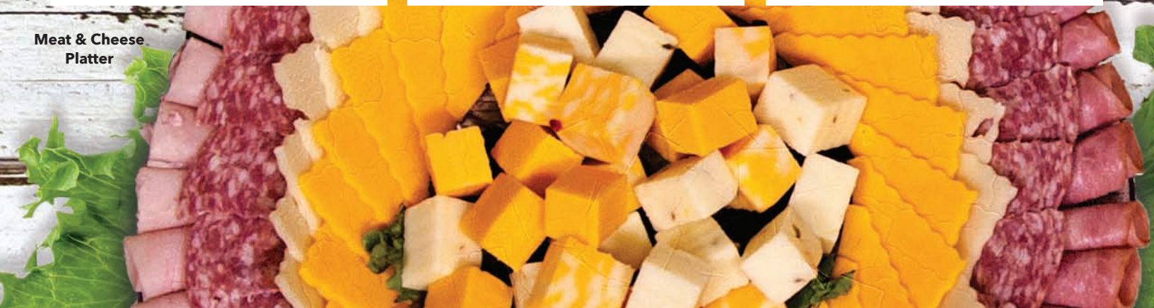
Meat & Cheese Platter