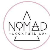
Nomad Cocktail Co.