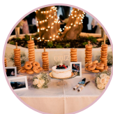
6' Banquet Tables (8) 60" Round Tables (20)