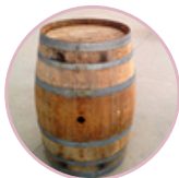
Wine Barrels (2)