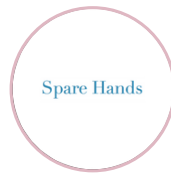
Spare Hands OC

FOR CLIENTS OPTING FOR FOOD TRUCKS, CART VENDORS, AND ANY A LA CARTE STYLE OF CATERING, YOU WILL NEED WAITSTAFF.