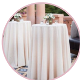
High Cocktail Tables (4)