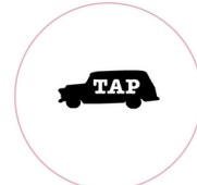
The Tap Truck