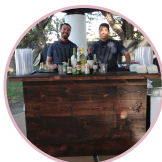
3' Wood Bars (2)