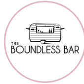
The Boundless Bar