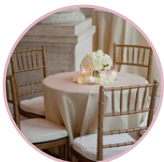
Low Cocktail Tables (4)