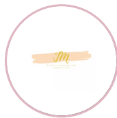
JME Planning and Production