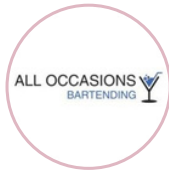
All Occasions Bartending