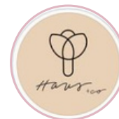
Haus & Co