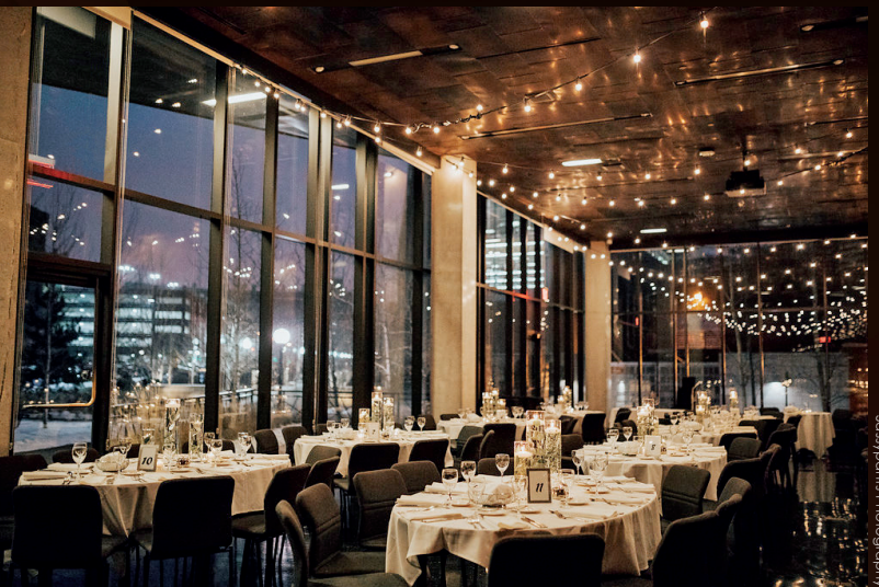
▲ University Hall