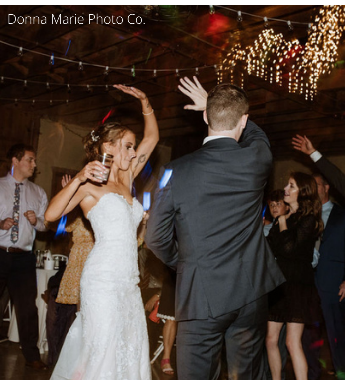
Donna Marie Photo Co.