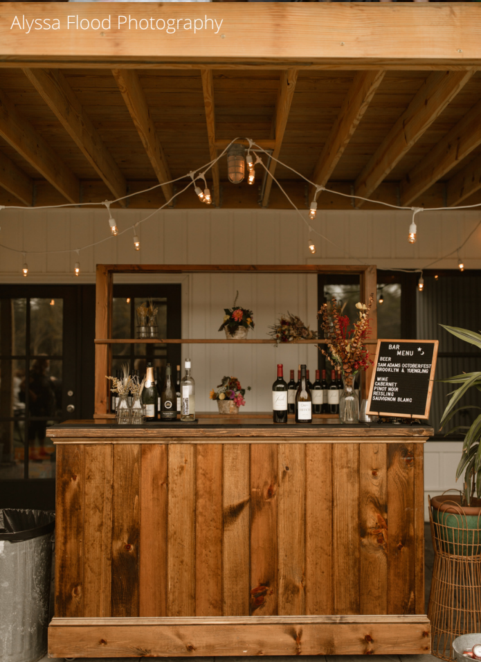
Alyssa Flood Photography