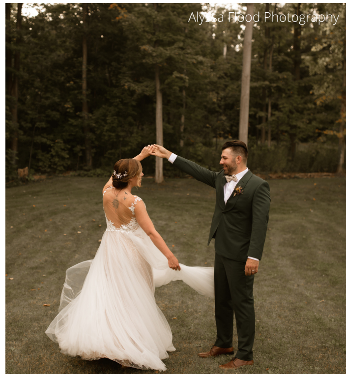
Alysa Flood Photography