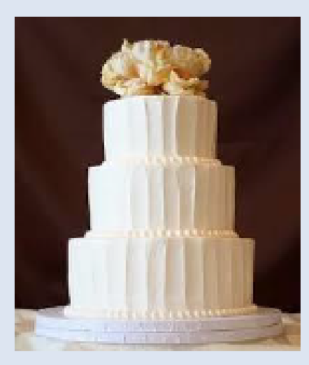
3 TIER SERVES 75-150 PEOPLE