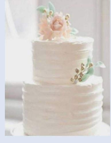
2 TIER SERVES 25-70 PEOPLE

DEPENDING ON YOUR GUEST COUNT, YOUR CAKE WILL EITHER BE 2 TIERS OR 3 TIERS. ELOPEMENTS WILL HAVE A SMALLER 2 TIER CAKE WITH CHOICE OF CHOCOLATE OR VANILLA BASE