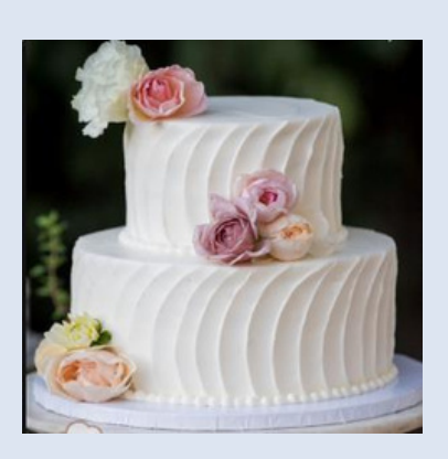
ANGLED RIGID DESIGN