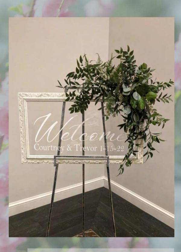
SIGN FLORALS Starting at $65