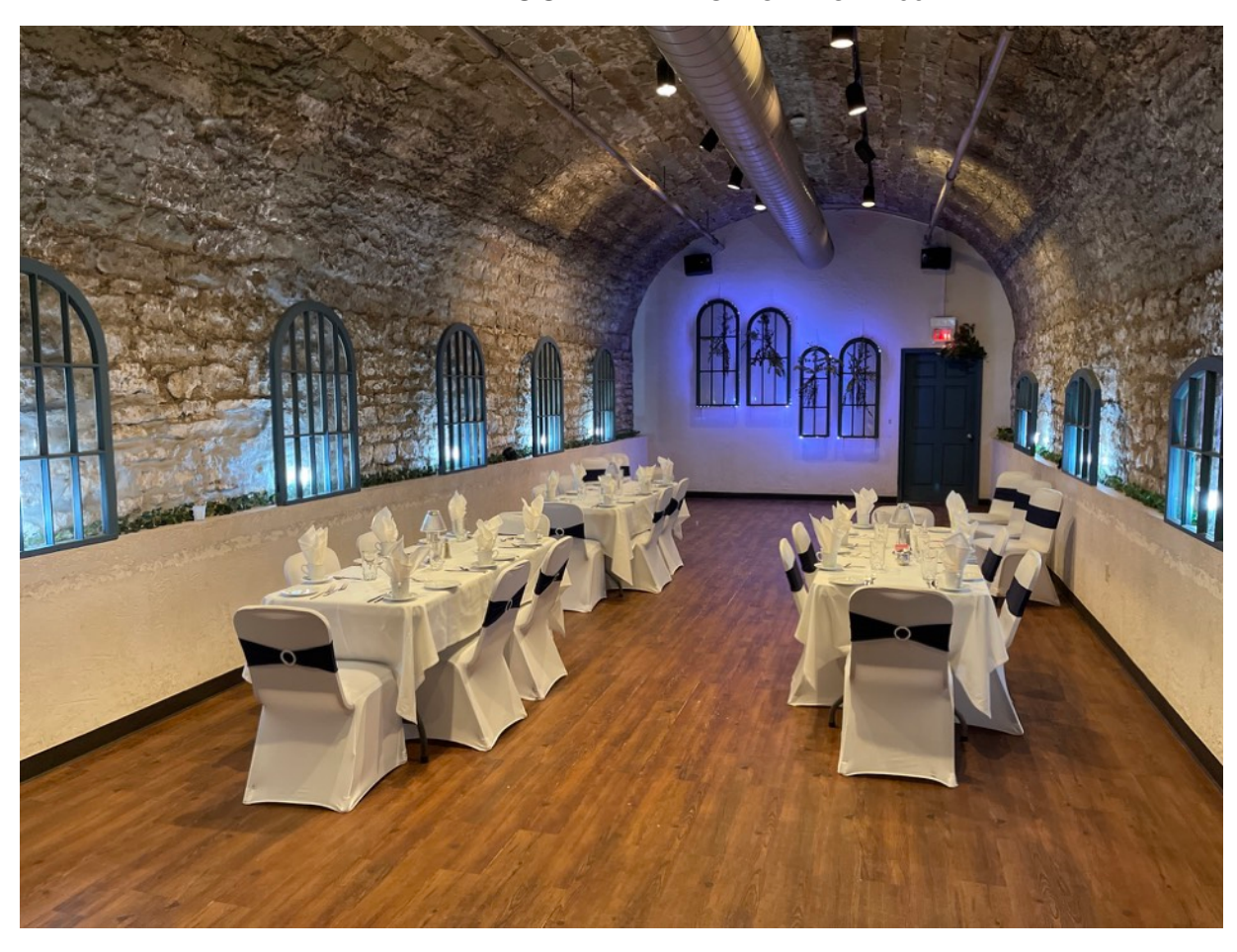
WINDOWS ROOM - MAXIMUM CAPACITY 48