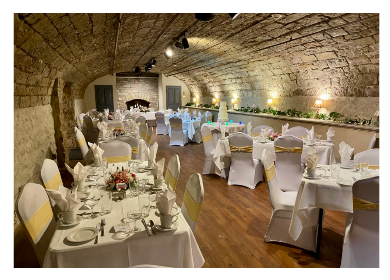
VINEYARD ROOM - MAXIMUM CAPACITY 96