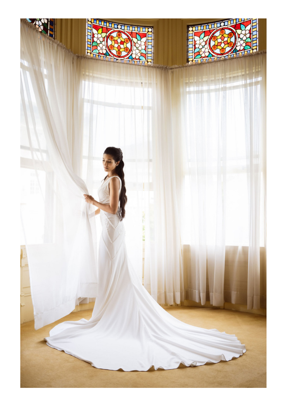
Package 1 Photography - $1650